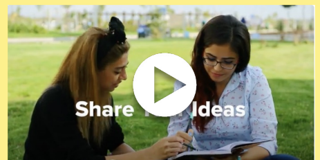
Watch video about IDST 150

Synchronous (On Zoom): Every other Wed. 1/31/24-5/15/24 Asynchronous: 1/31/24-5/15/24 Click here to enroll