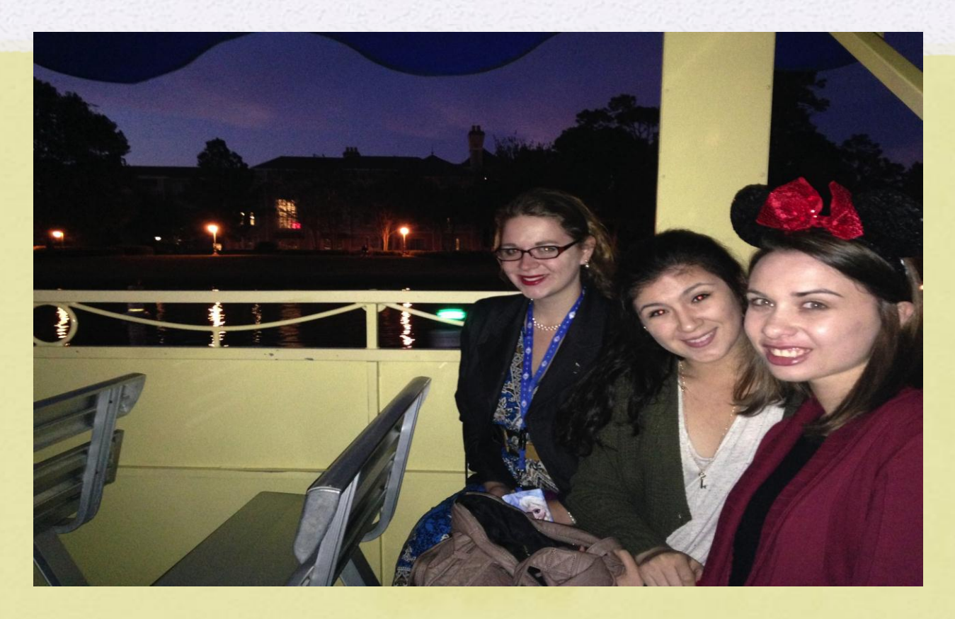
Becoming like a family despite any differences.